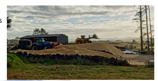
Both stack machines working together during the maize season