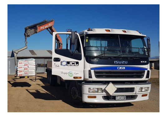
The Hiab doing on farm seed deliveries