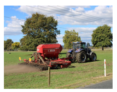
Jake operating the 6m Horsch Drill