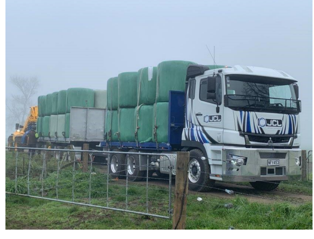
Scott hauling silage bales in the new truck and trailer